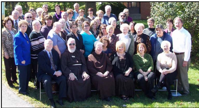
The Holy Eucharist Fraternity Independence, Missouri