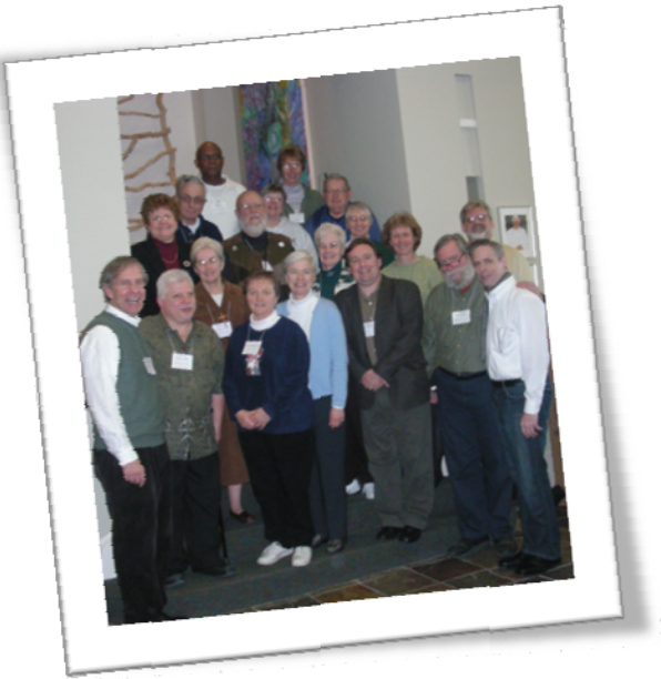
FAN Group Picture by Dan Mulholland, SFO