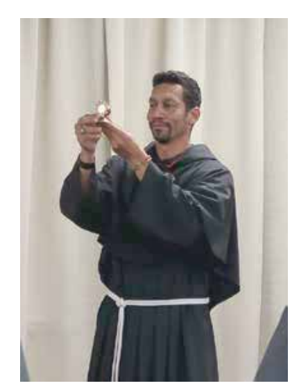
The relic of St. Francis is present at each Chapter meeting.

St. Louis on hisfeast day, budget adoption, the Minister's State of the Order Address, the JPIC award, and an activity demonstration by the CentenaryCommittee.