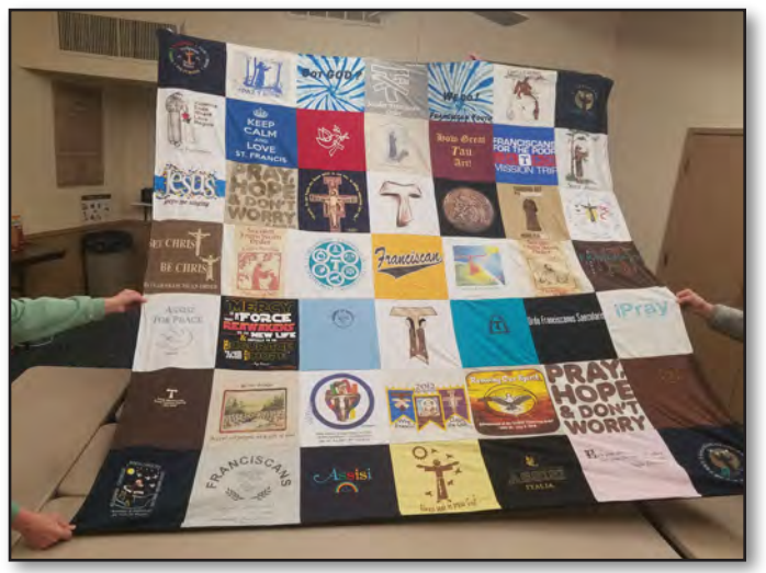
One of our raffle prizes is this lovely queen size t-shirt blanket.