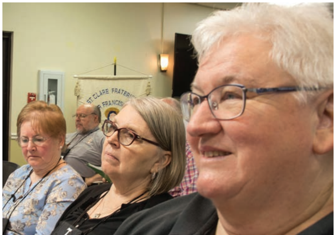
The National Chapter in session.